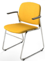
MX-2S A : 17" C : 18" E : 14"