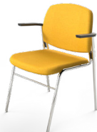
MX-4S A : 17" C : 18" E : 14"