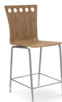
GO-7 A : 16" C : 24" E : 17"