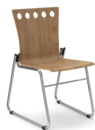
GO-2S A : 16" C : 18" E : 17"