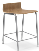
GO-9 A : 16" C : 24" E : 5"