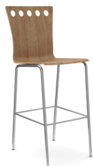
GO-8 A : 16" C : 30" E : 17"