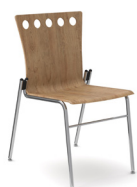
GO-4S A : 16" C : 18" E : 17"