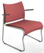
CA-2 A : 18" C : 18" E : 13"