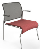
CH-4 A : 18" C : 18" E : 14"