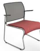
CH-2 A : 18" C : 18" E : 14"