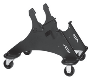
CA-20 A : 23" C : 20"