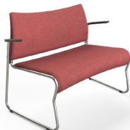
CB-2 A : 26" C : 18" E : 13"