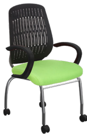
WE-H-4 A : 20" C : 18" E : 22"