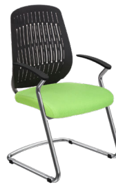
WE-H-6 A : 20" C : 18" E : 22"