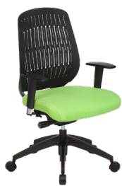
WE-H A : 20" C : 17" - 22" E : 22"