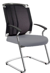
VO-L-6 A : 20" C : 18" E : 22"