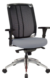
VO-H A : 20" C : 17"- 22" E : 24"