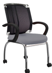
VO-L-4 A : 20" C : 18" E : 22"