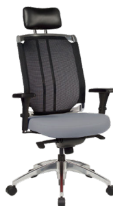
VO-E A : 20" C : 17"- 22" E : 32"