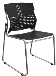
SE-2 A : 18" C : 18" E : 14"