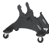
SE-20 A : 22" C : 24"