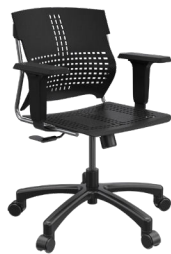
SE-L A : 18" C : 16" - 21" E : 14"