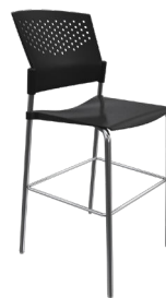
PN-8 A : 17" C : 30" E : 13"