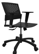
PN-L A : 17" C : 17"- 22" E : 13"