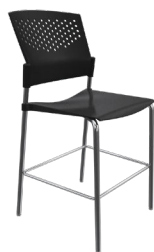
PN-7 A : 17" C : 24" E : 13"