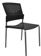
PN-4 A : 17" C : 18" E : 13"