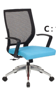
ML-H A : 19" C : 17 1/2 " - 22 1/2 " E : 22"