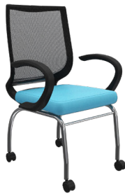
ML-H-4 A : 19" C : 18" E : 22"