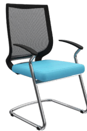
ML-H-6 A : 19" C : 18" E : 22"