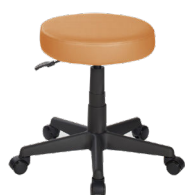
TB-O A : 15 1 / 2 " C : 18"- 23"