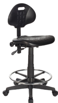
LB-L A : 18" C : 18"- 23" E : 12"