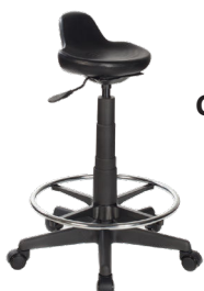
SD A : 13" C : 18"- 23"