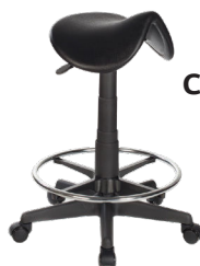
HS A : 16" C : 18"- 23"