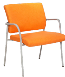
FB-4 A : 25" C : 18" E : 16"