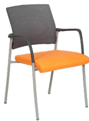
FH-4 A : 20" C : 18" E : 15"