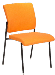
FI-4 A : 20" C : 18" E : 16"