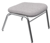
EC-O-4 A : 23 3 / 4 " C : 17 3 / 4 "