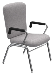
EC-H-4 A : 19 1 / 4 " C : 18" E : 20"