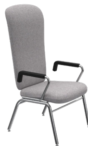
EC-E-4P A : 19 1 / 4 " C : 18" E : 28"