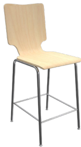
CM-7 A : 16" C : 24" E : 17"