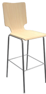
CM-8 A : 16" C : 30" E : 17"