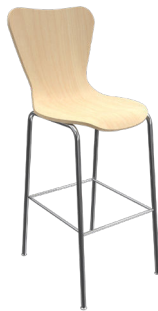
CL-8 A : 18" C : 30" E : 17"