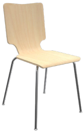
CM-4 A : 16" C : 18" E : 17"