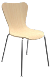
CL-4 A : 18" C : 18" E : 17"