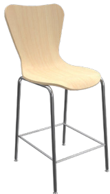
CL-7 A : 18" C : 24" E : 17"