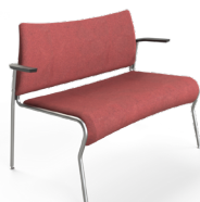
CB4 A : 26" C : 18" E : 13"