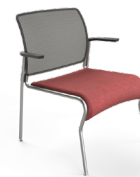
CH4 A : 18" C : 18" E : 14"