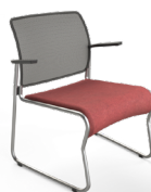
CH2 A : 18" C : 18" E : 14"