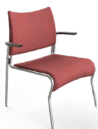
CA4 A : 18" C : 18" E : 13"