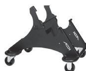
CA20 A : 23" C : 20"