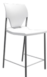
AV-7 A : 16" C : 24" E : 15"