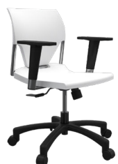
AV-L A : 16" C : 17"- 22" E : 15"