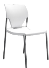
AV-4 A : 16" C : 18" E : 15"