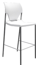
AV-8 A : 16" C : 30" E : 15"