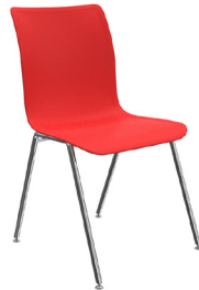
CO4A A: 17 3/4 " C: 18" E: 16 3/4 "