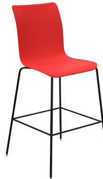
CO8 A: 17 3/4 " C: 29 1/2 " E: 16 3/4 "