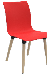
CO4B A: 17 3/4 " C: 18" E: 16 3/4 "