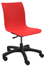
COBE A: 17 3/4 " C: 13 1/2 " - 18 1/2 " E: 16 3/4 "